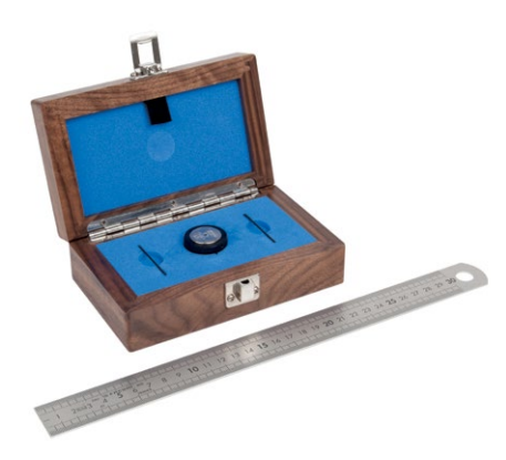
MPX Geometrical Calibration Artefact (Optional)