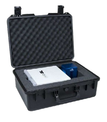
MPX-2 in Carrying Case (Optional)