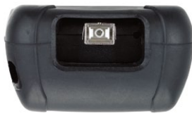
Top-side view of the FOT-5200