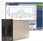
Optical Spectrum Analyzer FTB-5240S