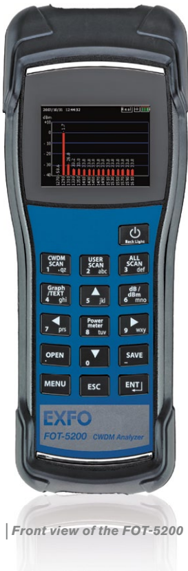
Front view of the FOT-5200