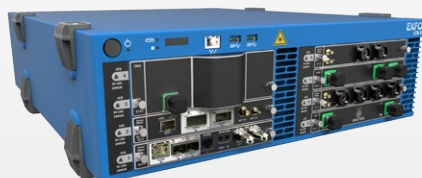
LTB-8 EIGHT-SLOT RACKMOUNT PLATFORM

WINDOWS ENVIRONMENT | BUILT-IN APPLICATIONS | THIRD-PARTY APPLICATIONS SCALABLE | HOT-SWAPPABLE MODULES | WIRELESS CONNECTIVITY | USB | WIFI | BLUETOOTH