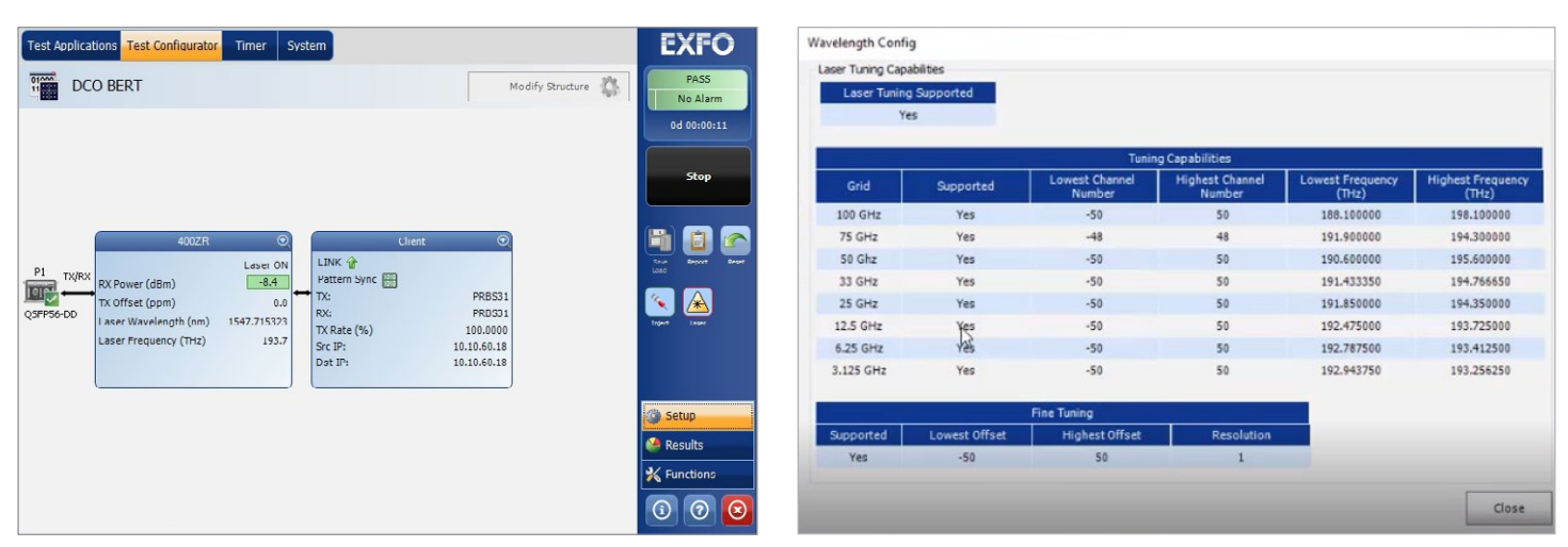
DCO Bert generation and analysis