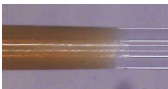
Polyimide stripping: Polymicro 330/300um, Polyimide coating shown.