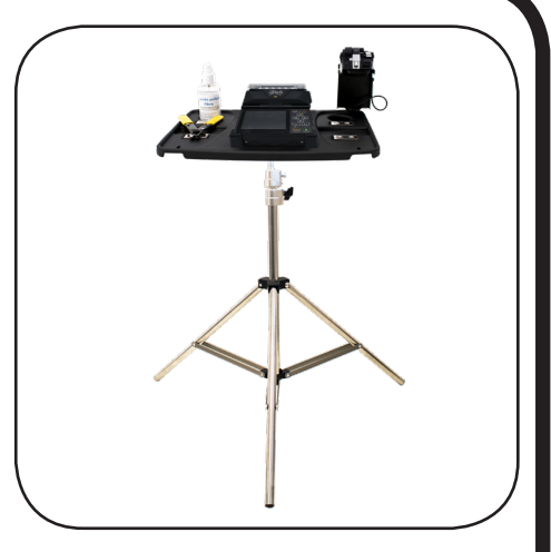
Tripod workstation system