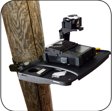
Pole mounting system