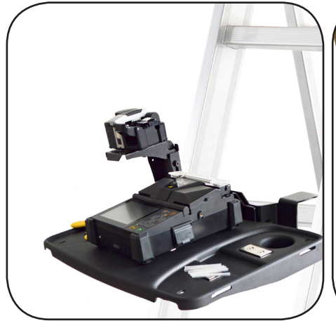
Ladder mounting system