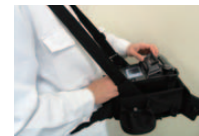
⑥-1 Working Belt in Action