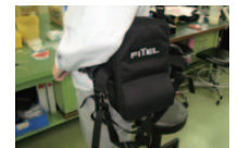
⑥-2 Working Belt in Action