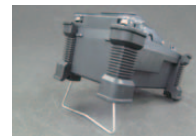
⑤ Angled Stand in Action